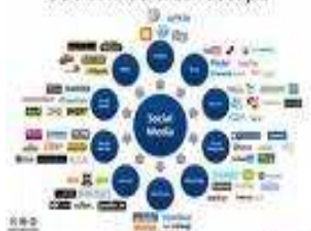
Social Media Landscape